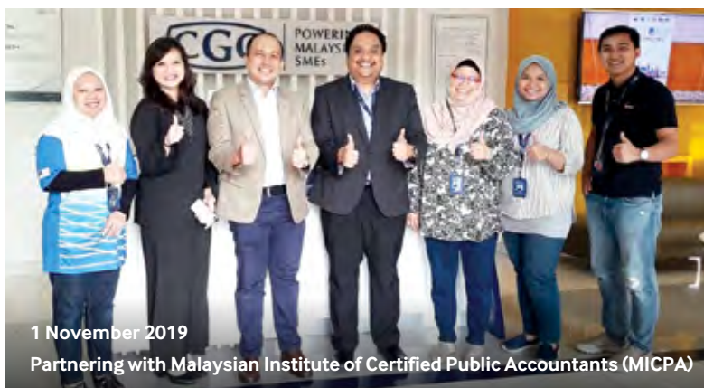
1 November 2019 Partnering with Malaysian Institute of Certified Public Accountants (MICPA)